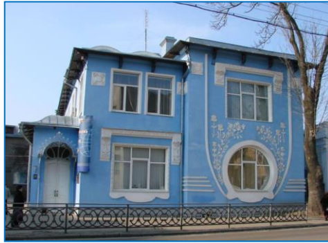
РІВНЕНСЬКИЙ МУЗЕЙ БУРШТИНУ