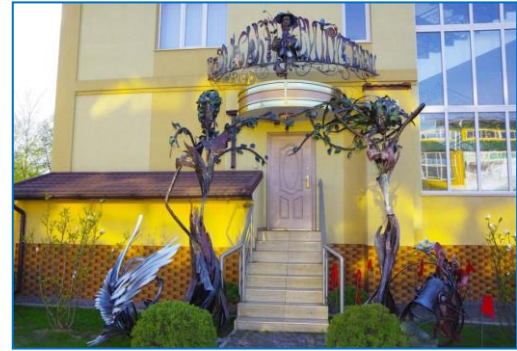
МУЗЕЙ КОВАЛЬСЬКОГО МИСТЕЦТВА