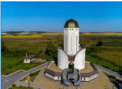
КУЛЬТУРНО-АРХЕОЛОГІЧНИЙ ЦЕНТР «ПЕРЕСОПНИЦЯ»