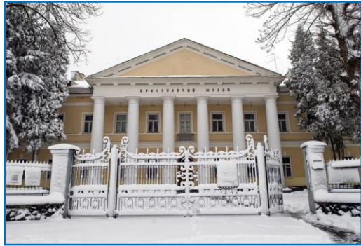
РІВНЕНСЬКИЙ ОБЛАСНИЙ КРАЄЗНАВЧИЙ МУЗЕЙ